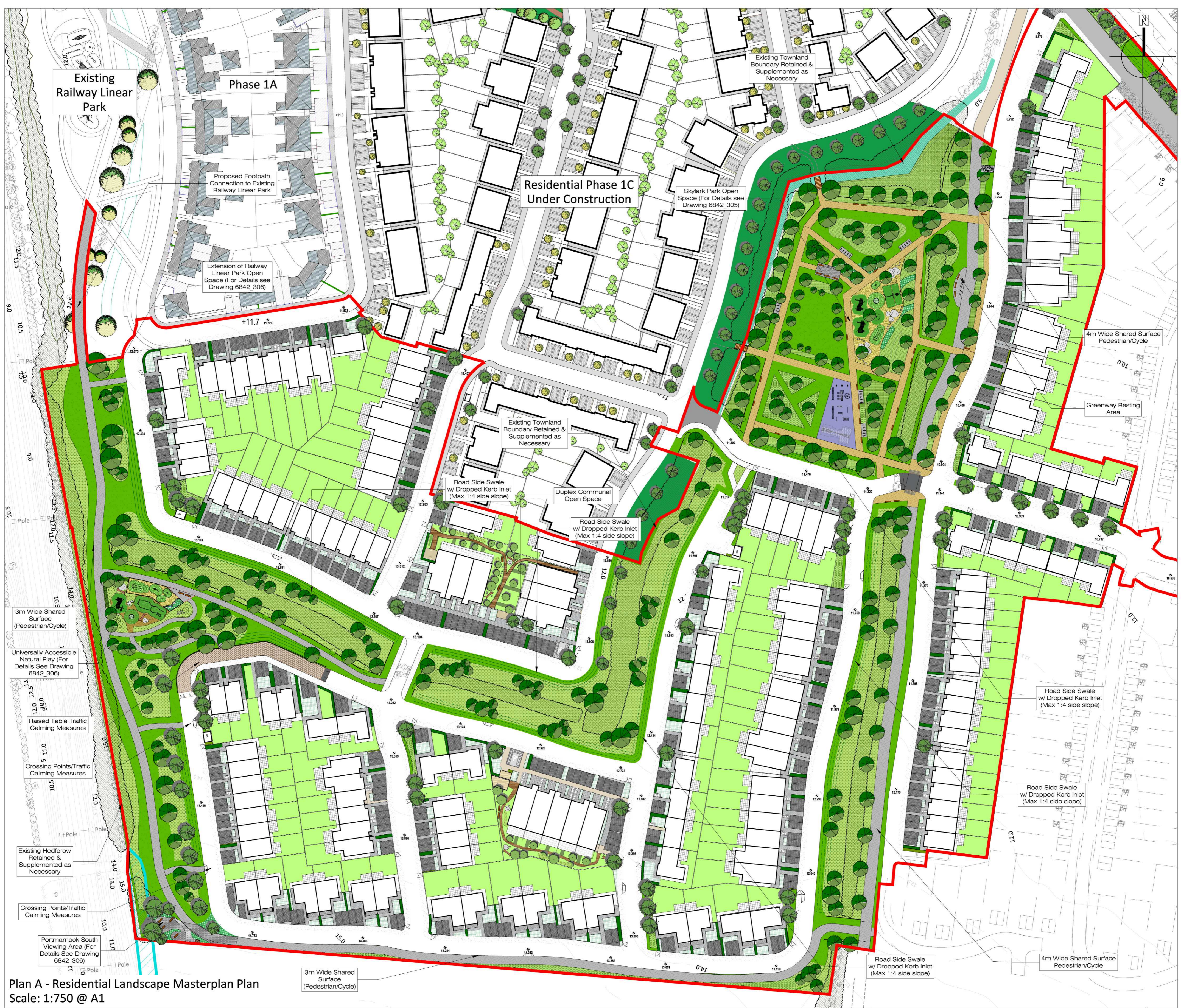
Plan A - Residential Landscape Masterplan Plan Scale: 1:750 @ A1